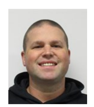
TIM 7G1, 7G2, 7G3 7T3, 7T4