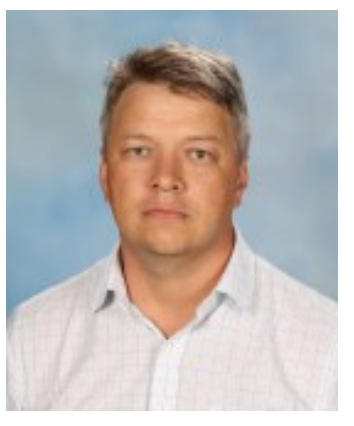
CONRAD 11G1, 11G2, 11G3, 11J1 11J2, 11J3