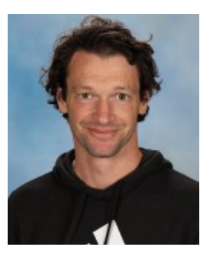
YOXFORD 8C1, 8C2, 8C3 8C4, 8G3